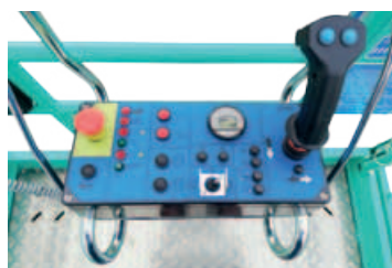
Simple and intuitive control box that can be removed from the basket for loading / unloading the machine