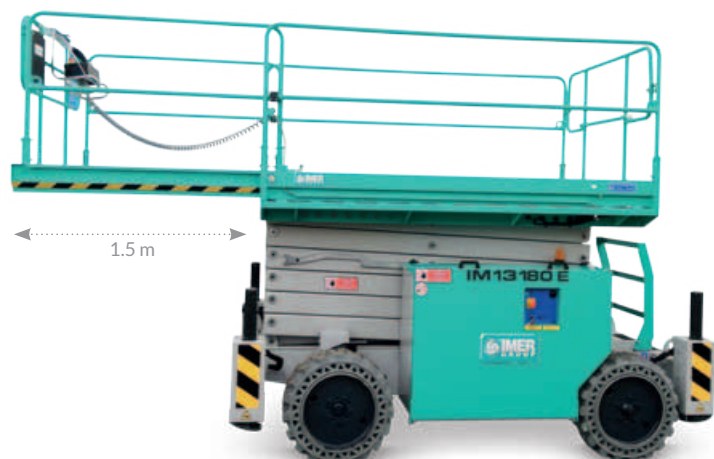
Manual deck extension of 1.5 m for a total length of 4.2 m